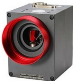
G3 pro head