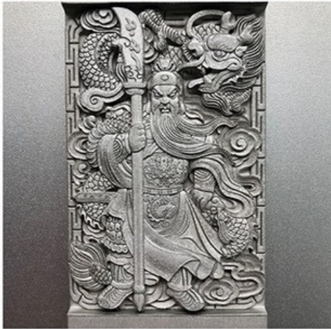
Relief size: 68*46*3.5mm Process time: 3 hours

Fiber 3D Laser is commonly used for deep engraving, relief, hardware processing, mold processing. Also it can be used for thin metallic artwork cutting. The processed material can be brass, aluminum alloy, mould steel