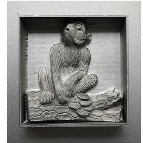
Relief size: 50*30*3mm Process time: 4 hours