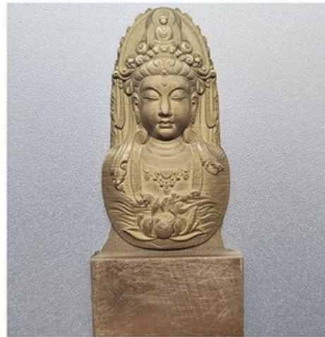
Relief size: 50*30*3mm Process time: 4 hours