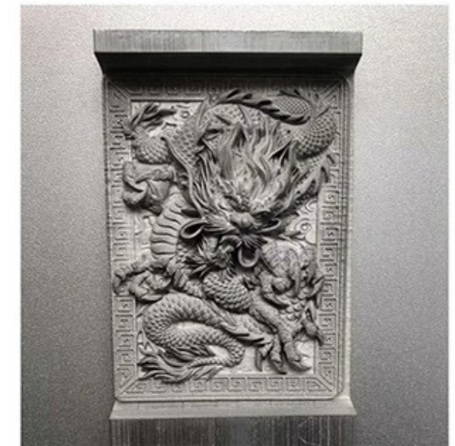
Relief size: 62*46*6mm Process time: 14 hours