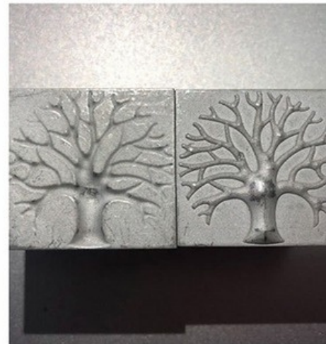
Relief size: 29*29*3.6mm Process time: 4 hours